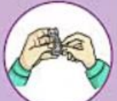
Joining pieces of clay together