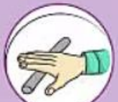
Rolling snakes with clay