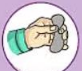
Squeezing the clay