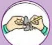
Creating holes or hollows in the clay with tools