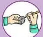
Carving details into the clay with tools