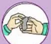
Pulling and pinching the clay with your fingers