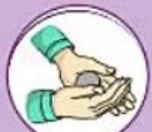
Rolling a ball of clay