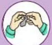
Smoothing out the clay with your fingers